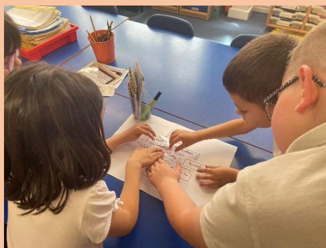
Students carrying out the diamond nine activity

Diamond Nine: In groups, children prioritised the same nine important issues promoting collaboration and the expression of ideas.