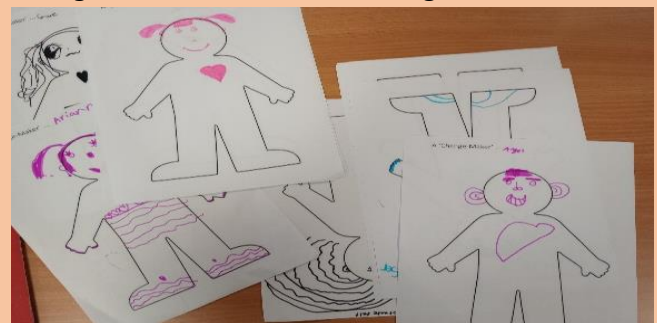
Human silhouettes made by students

Change-maker Silhouettes: Using human silhouette