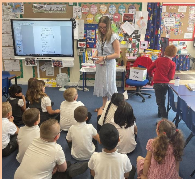
Students voting for the most important issues according to them

Emotions thermometer: Using coloured paper, pupils expressed their emotions about topics such as family and litter. This activity, guided by colour-coded emotions (e.g., Red for anger, Blue for happiness), emphasised the importance of emotional awareness in developing change-makers.