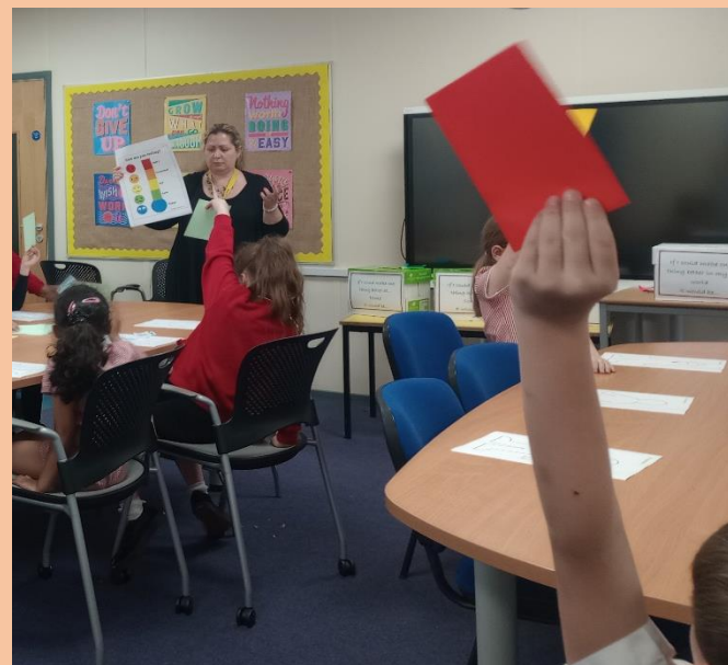
Students using coloured paper to express emotions

Role-Playing: Students engaged in role-playing scenarios, practising as speakers, listeners, and disruptors. This activity developed change-maker skills by emphasising active listening and respect for others.